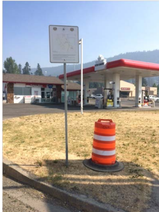
Muster points are marked with signage and high-visibility barrels.